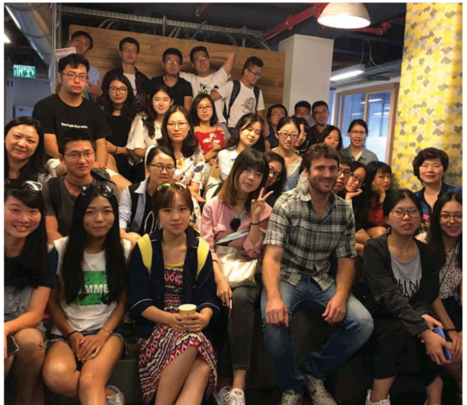
CHINESE STUDENTS studying at the University of Haifa pose recently for a photograph at the Powerball Center in Rehovot.

The highly anticipated addition to the Technion is scheduled to open its doors in October. Some 240 students from several provinces in China have enrolled for study at the Technion branch, which offers three engineering programs: chemical, material science and biotechnology and food engineering. Preparatory studies begin this month and the first semester begins in October.