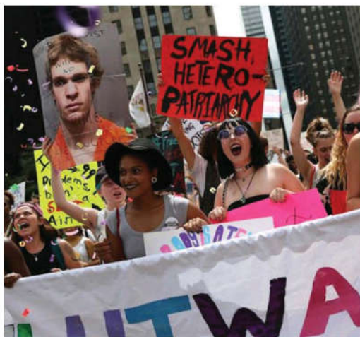
WOMEN PARTICIPATE in the annual SlutWalk Chicago march against sexual violence last August. (Screenshot)

The women joined a rally ahead of the march in a local park. According to reports, they carried signs depicting a woman wearing a Star of David necklace and in some cases wore rainbow-colored T-shirts emblazoned with a Star of David. When