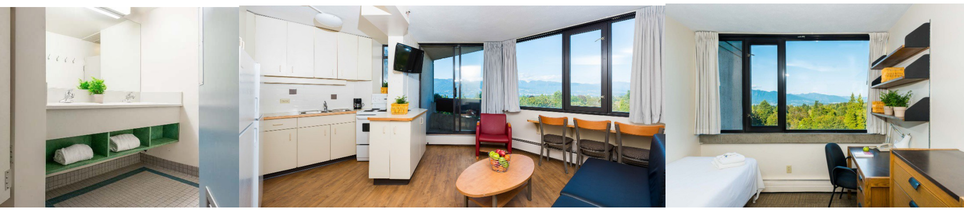
If capacity in the apartments and semi-private units are exceeded, students will be placed in traditional student dormitories