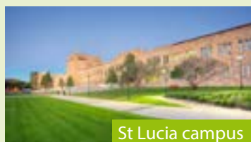
St Lucia campus