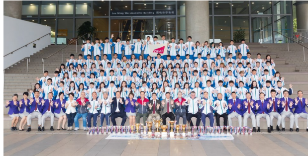
9 th Grand Slam