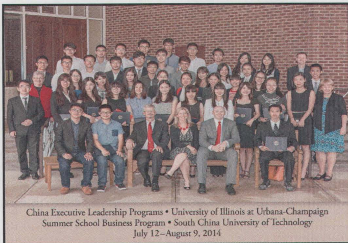
China Executive Leadership Programs • University of Illinois at Urbana-Champaign Summer School Business Program • South China University of Technology July 12–August 9, 2014

We look forward to welcoming you to our campus this summer!