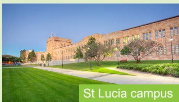
St Lucia campus