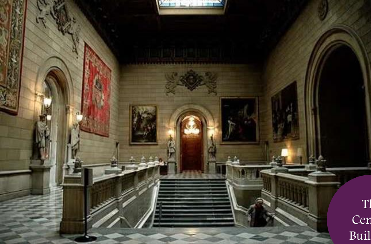
The Central Building