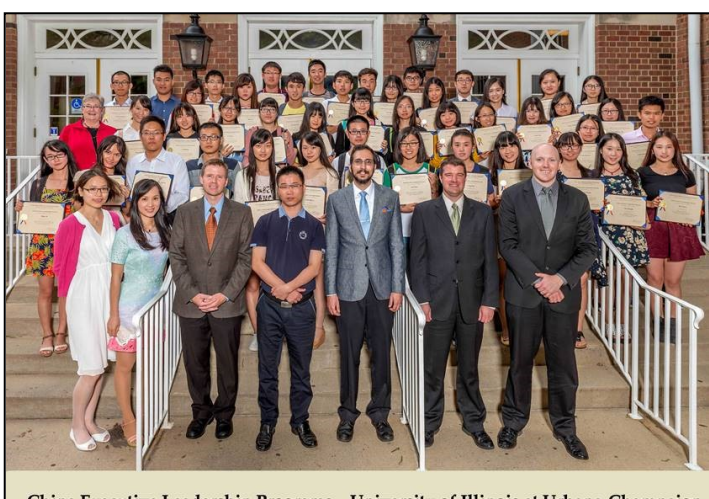
China Executive Leadership Programs – University of Illinois at Urbana-Champaign Economics Summer School Program - South China University of Technology July 18-August 8, 2015

The University of Illinois is situated in the middle of a vibrant community, rich in culture, with plenty of activities suitable to your interests. Please use the following link to access more detailed information about our campus and community: <a href="https://www.illinois.edu">www.illinois.edu</a>